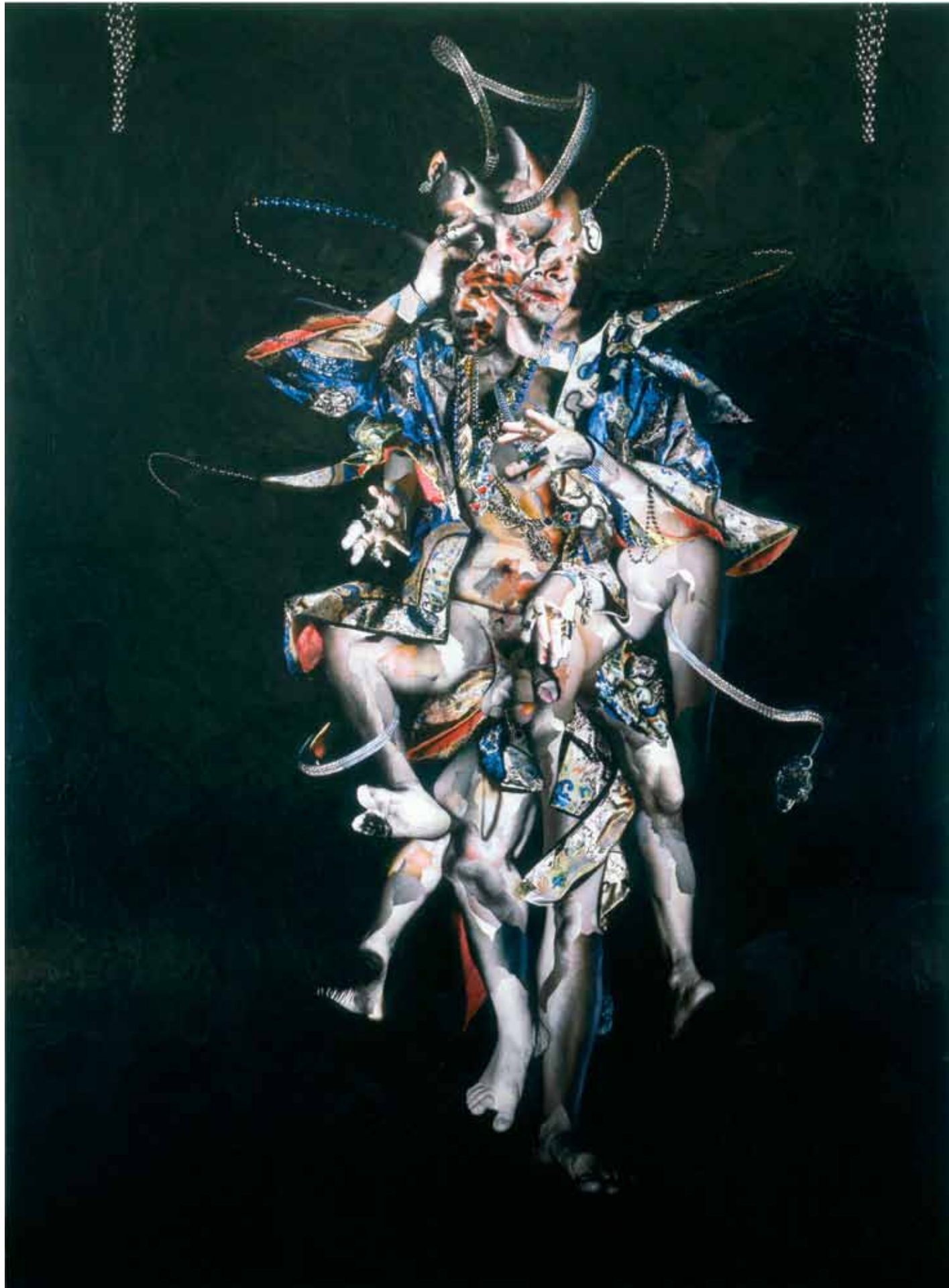
Tanz Fur Mich Salome (Dance For Me Salome: Self-Portrait) , 2009 collage and bees wax on aluminum panel 68 x 92 inches Courtesy of the artist and The Butcher's Daughter Contemporary Art, Ferndale, MI